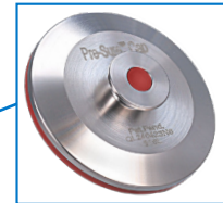
FIG. 1 - STAINLESS STEEL RETAINER & SILICONE DIAPHRAGM