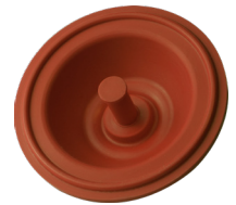
FIG. 2 - SILICONE DIAPHRAGM

INTERNATIONAL PATENTS PENDING - US PATENT APPLICATION NO. 17/044,881