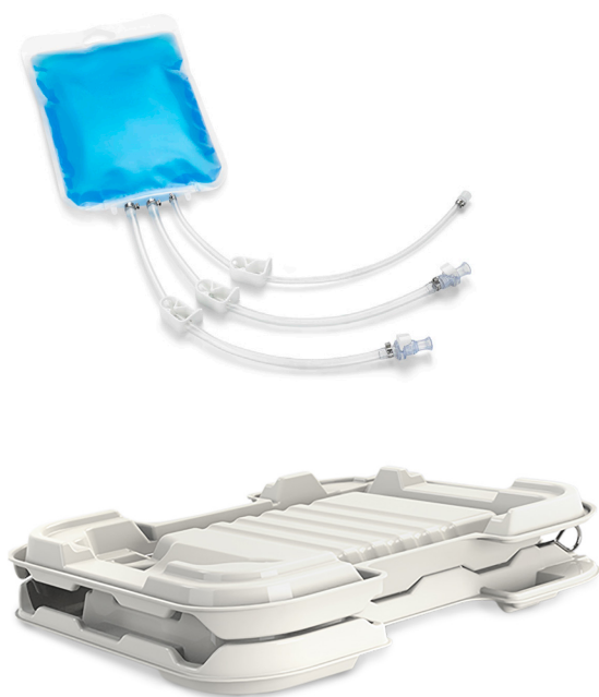
Aramus single-use 2D bag assembly and Entegris blast freezing shell.

Aramus™ single-use 2D bags, combined with the Entegris blast freezing shells, provide an easy-to-use, lightweight, and reusable secondary container solution for use with controlled rate convection or standard lab cold-wall freezers. The blast freezing shells are provided double bagged and are boxed in quantities of 10 (2 L shells) or 5 (5 L shells). This document explains how to most effectively handle and reuse the Entegris blast freezing shells in cold-chain applications.