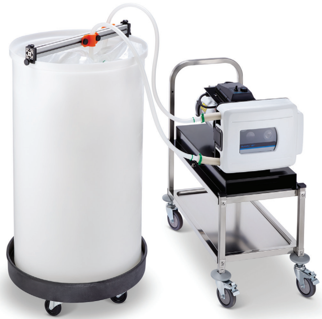
Custom sizes, configurations, and materials available to meet your needs