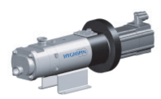
HYGHSPIN with compact synchronous motor